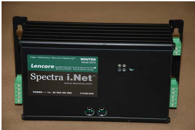
Lencore Spectra i.Net™ Router

Paging and music may also be routed out of the router via internal jumpers to the screw terminals located on either end of the router to integrated OP amps or component amplifiers and equalizers for signal boost and correction. This setup is typically run at approximately the 60th OP in a run.