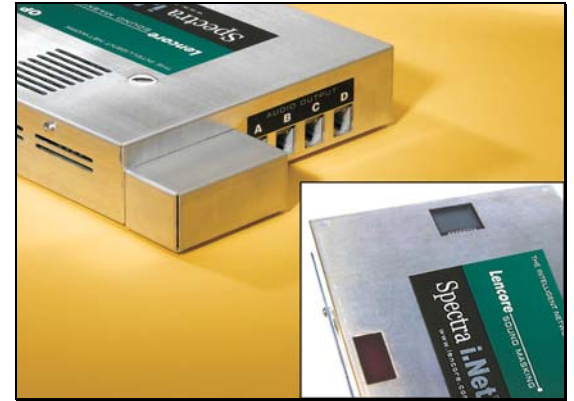
OP is UL Listed and approved for use in air-handling spaces.

The Spectra i.Net™ system is the most sophisticated masking system available when a network system is required. The system features fast, complete control over every sound frequency for masking. Extreme design flexibility, plus, easy system expansion with the addition of sound sources and speakers to the network. Sound control with the click of the remote or mouse, even off-site. Preferred, award-winning sound quality, only from Lencore's Systems.